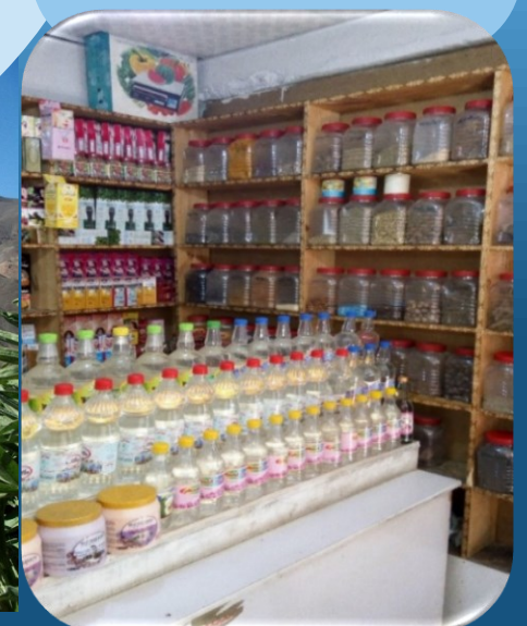
A clinic of traditional healers in Kabul, Afghanistan (Babury 2018)