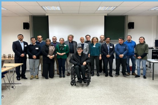
Workshops: Nurturing Future: Establishing the Centre for Oriental Traditional Medicine, Marburg, Nov.2023